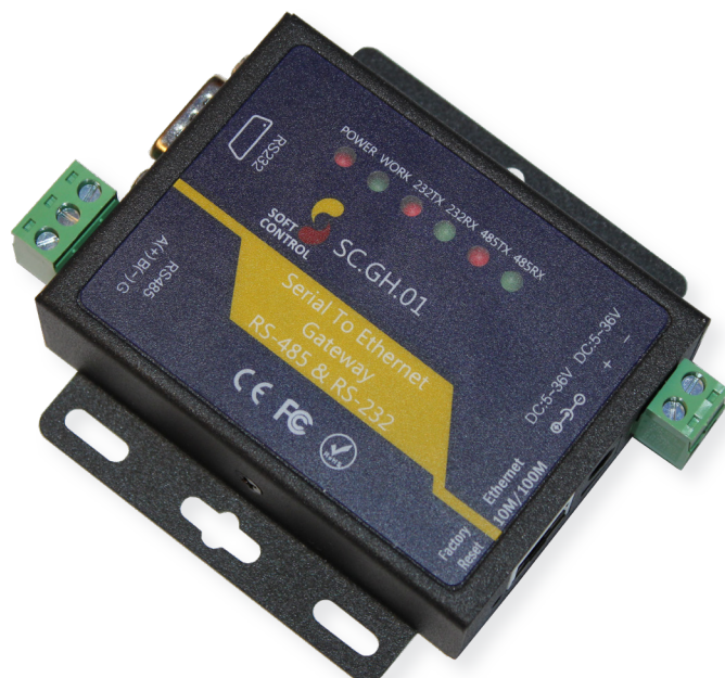
Ill. 1 - Image of SC.GH.01.